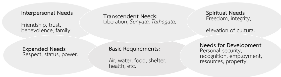
Figure 2: Priority of Needs for People with Transcendent Needs

Sakyamuni Buddha and all the eminent thinker's life pursuit is to seek the Truth about the cosmos and human life. Their values or hierarchy needs were transcending the mundane life, so they never placed fame, wealth, esteem, social position in the first place, all these were only their secondary concerns.